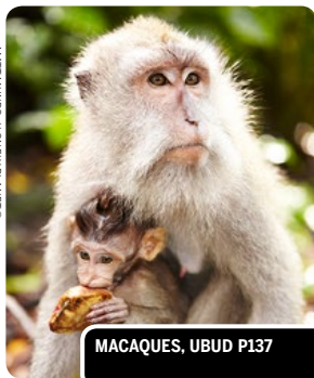
MACAQUES, UBUD P137