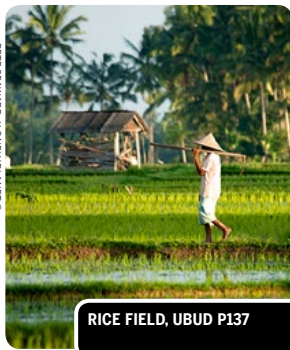
RICE FIELD, UBUD P137